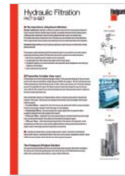
Hydraulic Filtration LT36182