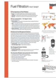
Fuel Filtration LT36179