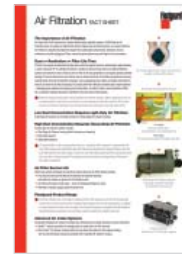
Air Filtration LT36178