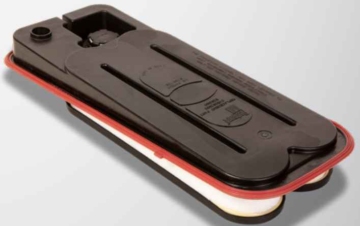
Fleetguard CV5062800 Crankcase Ventilation System

Don't take chances with cheap CV filters. Nothing guards like Fleetguard.