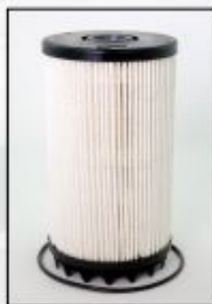
FS36401 10 Micron