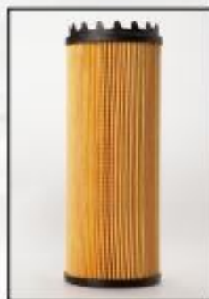
FS20208 30 Micron