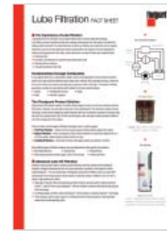
Lube Filtration LT36180