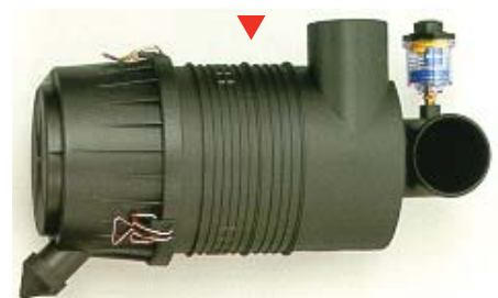
Dual Stage Air Filtration System including restriction indicator for high Dust Environment

Pre-cleaned air passes through main filter