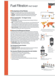
Fuel Filtration LT36179