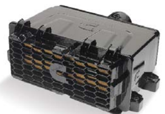
State-of-the-Art: Direct Flow™ Air Filtration System