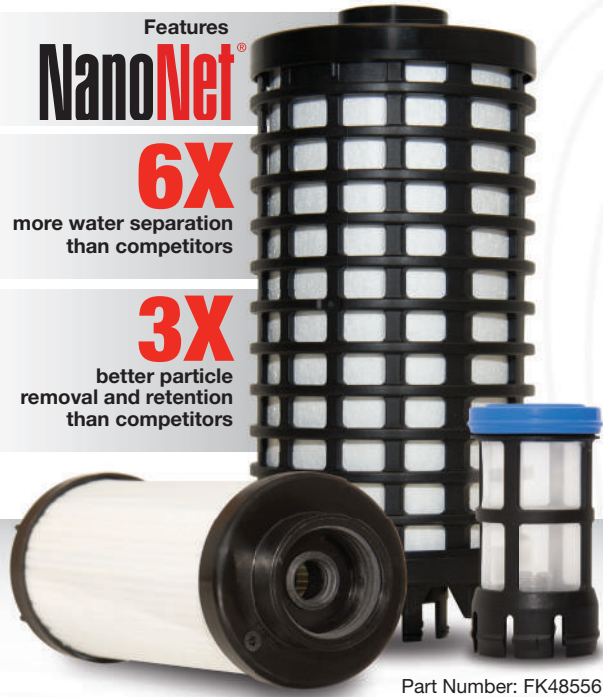
Part Number: FK48556

3X better particle removal and retention than competitors