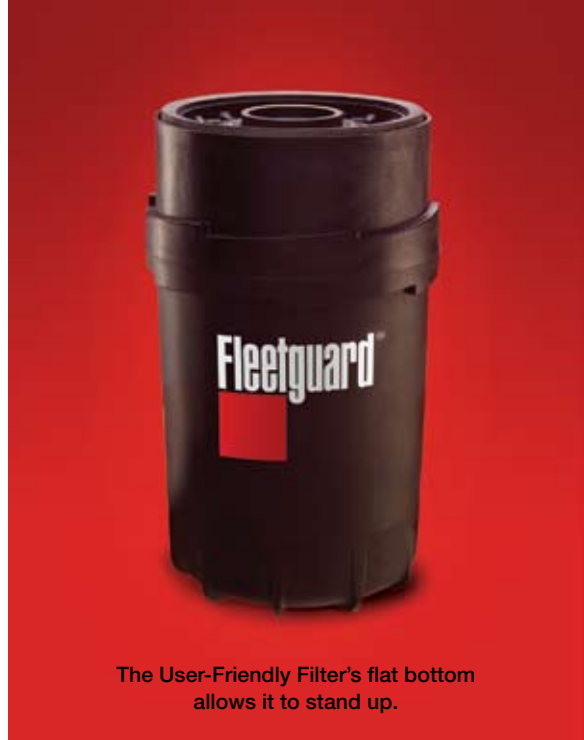
The User-Friendly Filter's flat bottom allows it to stand up.

Finally, there's a filter that's easy to spin on, easy to take off, and that won't tip over when you set it down. The user-friendly filter is designed to obsolete metal filters, with advanced polymer materials inside and out for superior performance with easier handling. Plus, because it's from Cummins Filtration – the industry's leading manufacturer of high-quality filtration products – you know that your engine is getting the best protection available.