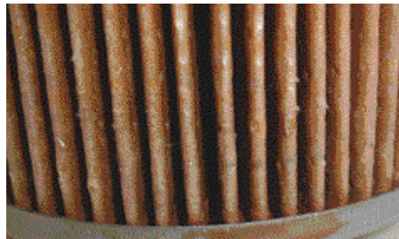
Colony of bacteria on fuel filter

When used as directed in a properly maintained fuel tank system, 2 treatments